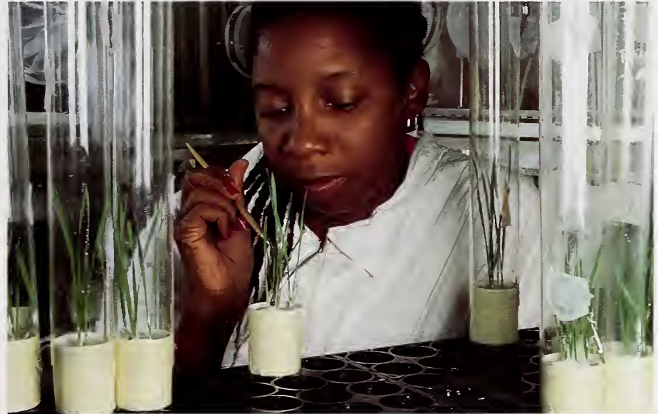
An APHIS laboratory technician counts laboratory-reared natural enemies for subsequent release.

coordinate extensive releases in infested States. Individuals from universities, ARS, and State departments of agriculture and other involved groups are relied upon to perform laboratory and field research that may help implement and evaluate the APHIS program.